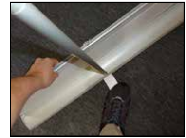
Using your foot to hold down the base, slowly pull graphic up.