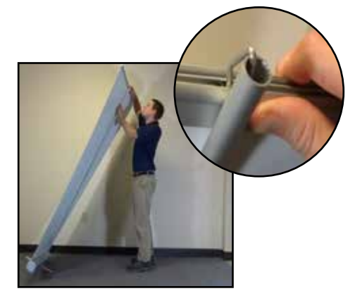
Lean banner back to hook top bar onto pole