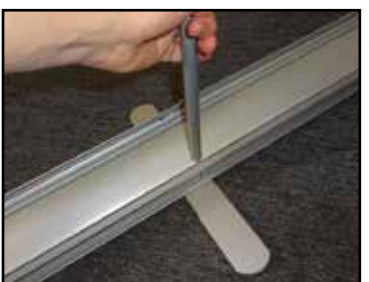
Extend bungied pole and insert into hole in base.