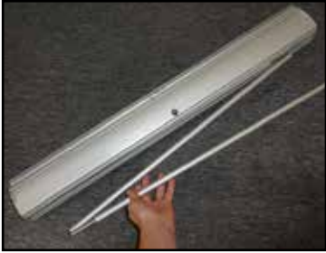
Remove bungied pole from back of banner stand base.