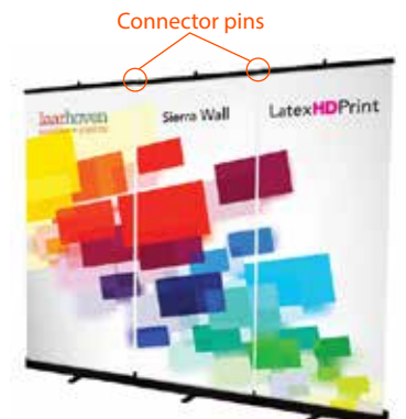
Note: There will be an approximate 1.25" gap between banner stands.