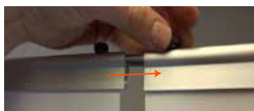
Slide connector into 2nd banner. Tighten both knobs. Repeat with additional banners to make a wall.