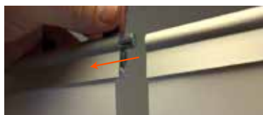
Slide connector all the way into circular slot top bar of 1st banner.