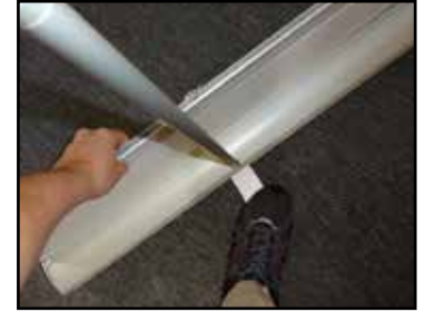
Using your foot to hold down the base, slowly pull graphic up.