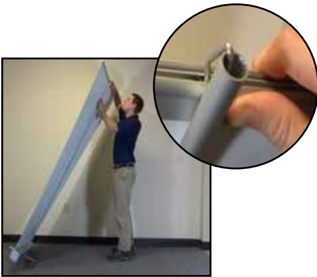
Lean banner back to hook top bar onto pole