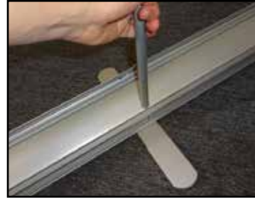
Extend bungied pole and insert into hole in base.