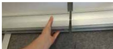
Align banner stands.