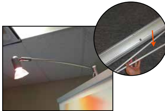
Attach optional adjustable light to top of pole. Hook goes through the front slot.